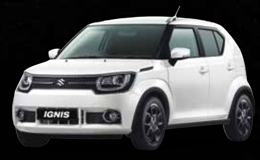
Pure White Pearl Shine, baby, shine

Super Black Pearl Like a sleek city slicker