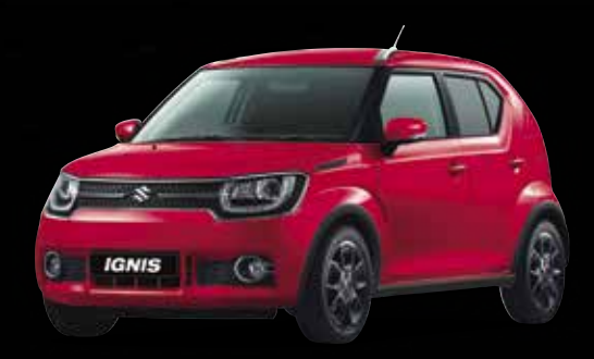
Fervent Red Drive a bold little number