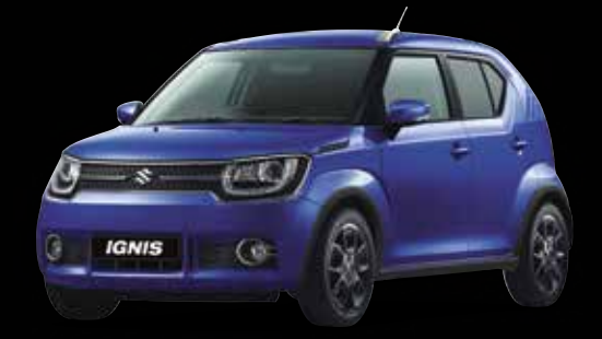
Boost Blue Pearl Metallic Drive into another dimension