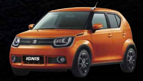
Flame Orange Pearl Metallic Take colour to the streets