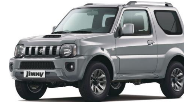
STEEL SILVER METALLIC†