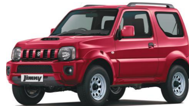
PHOENIX RED PEARL METALLIC*