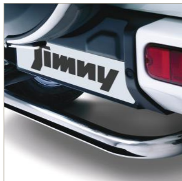
CHROMED REAR SPORT BAR