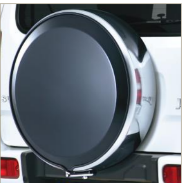
HARD SPARE WHEEL COVER