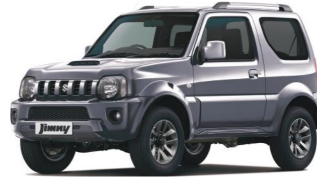
QUASAR GREY METALLIC**