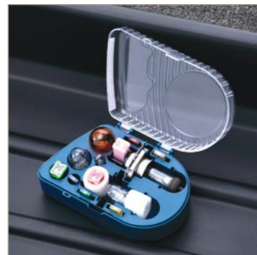
SPARE BULB AND FUSE SET