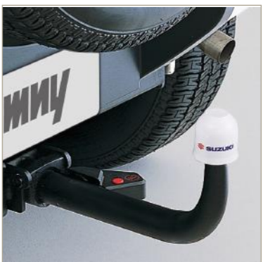
DETACHABLE TOW-BAR ASSEMBLY