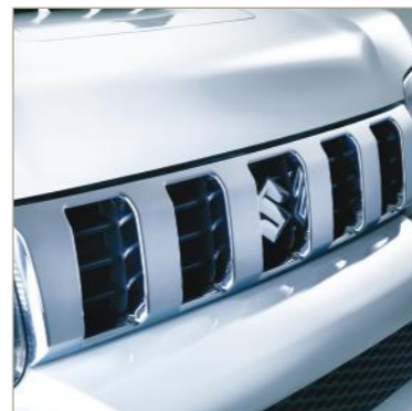
CHROMED FRONT GRILLE TRIM