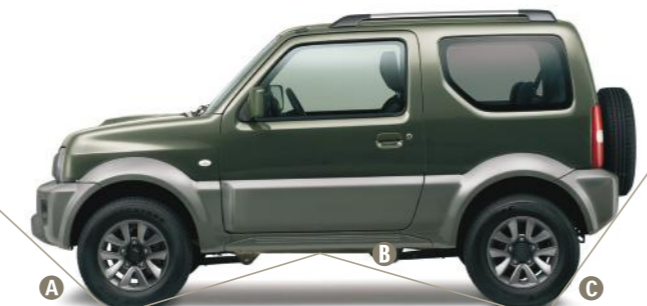
A 34° approach angle (default setting, unloaded Jimny) B 31° ramp breakover angle C 46° departure angle

All year round, the Jimny is a 4x4 designed for adventure. Every time you climb aboard, there's one waiting to happen.