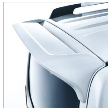
REAR UPPER SPOILER