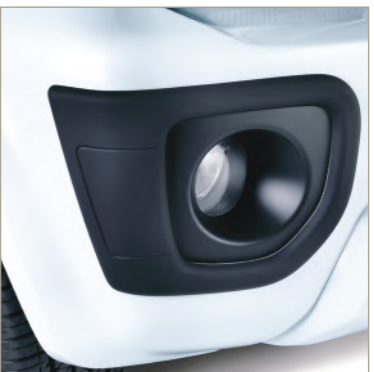
BUMPER CORNER PROTECTOR SET