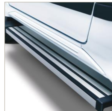
ALUMINIUM RUNNING BOARD

Whether you're down the high street or up a mountain, the Jimny has the versatility to cope. And its range of good-looking, hard-working accessories only makes it better. You'll find all of them on our website. So for once, we're going to suggest you let your fingers do the walking to: suzuki.co.uk/cars/accessories