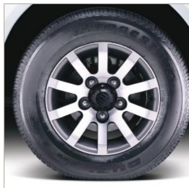
'DAKAR' ALLOY WHEEL