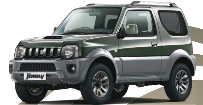
KHAKI GREEN METALLIC/ QUASAR GREY 2-TONE†