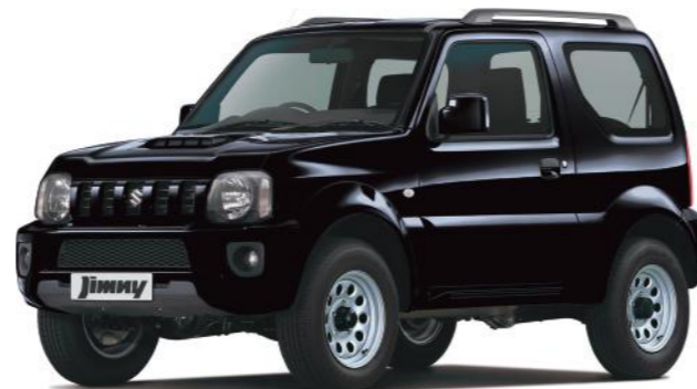
BLUEISH BLACK PEARL METALLIC*