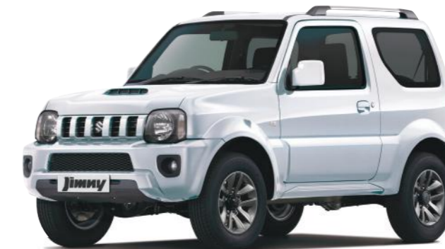
PEARL WHITE METALLIC†