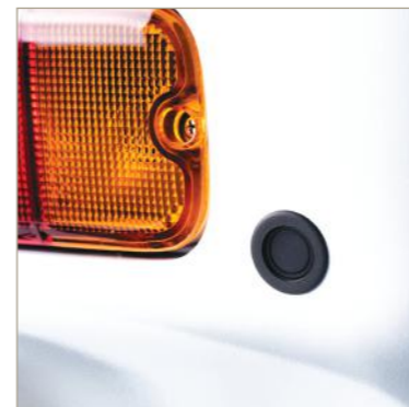
REVERSING AID SENSOR SET