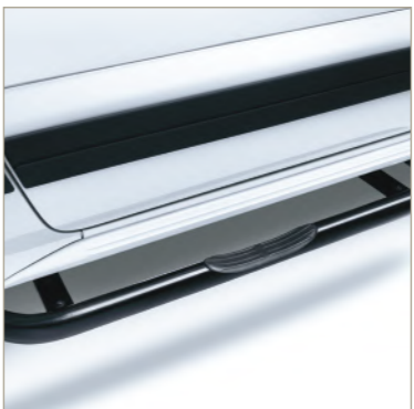
SIDE SPORT BAR SET (BLACK)