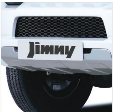
FRONT SKID PLATE