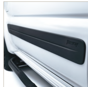
SIDE MOULDING SET