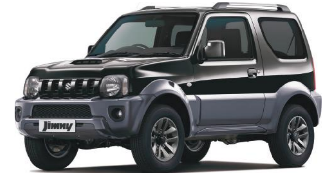
BLUEISH BLACK PEARL METALLIC/ QUASAR GREY 2-TONE†