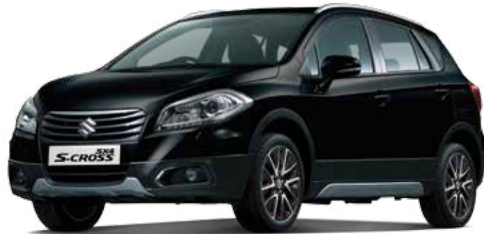
COSMIC BLACK PEARL METALLIC