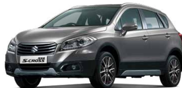
GALACTIC GREY METALLIC