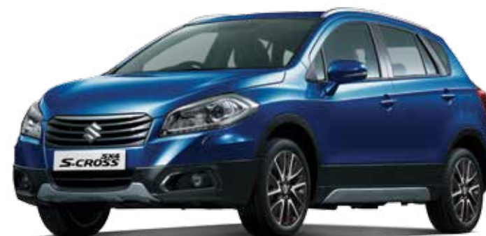
BOOST BLUE PEARL METALLIC