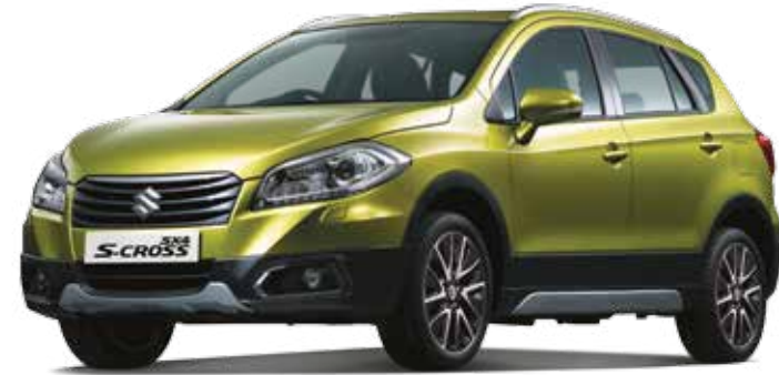
CRYSTAL LIME METALLIC