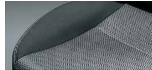
FABRIC WITH SILVER STITCHING (SZ4, SZ-T)