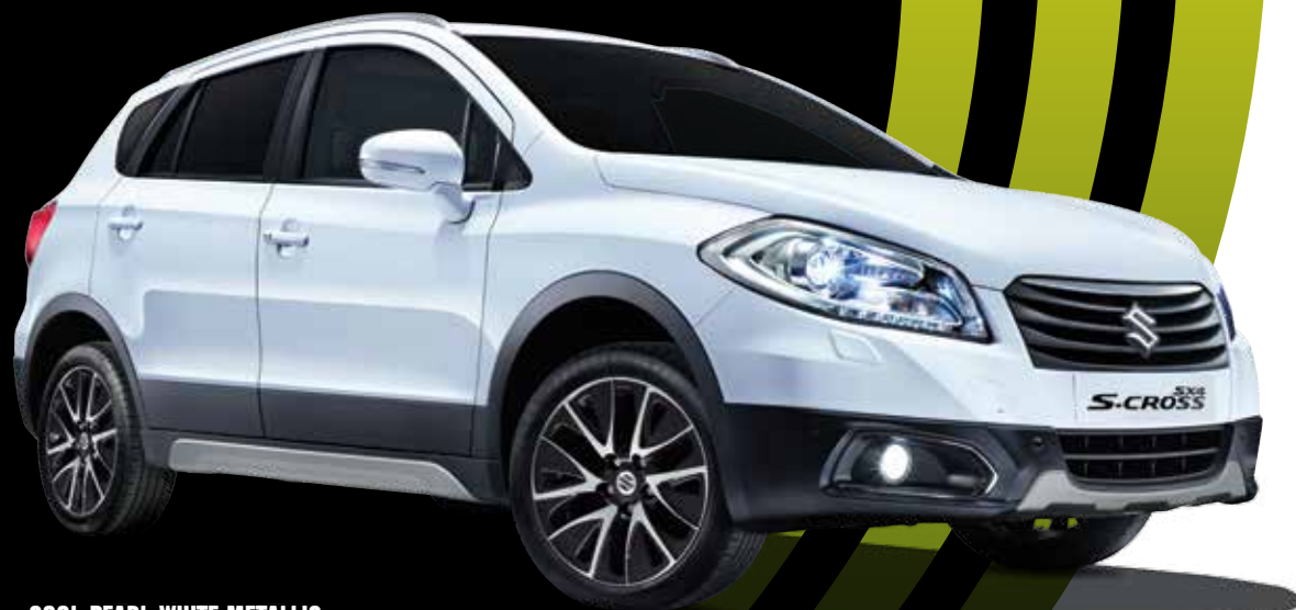
COOL PEARL WHITE METALLIC