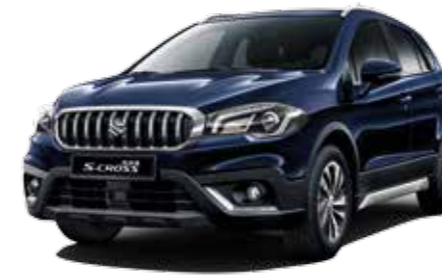
Sphere Blue Pearl Metallic