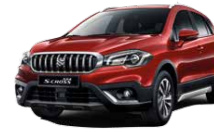
Energetic Red Pearl Metallic