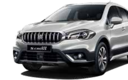
Silky Silver Metallic