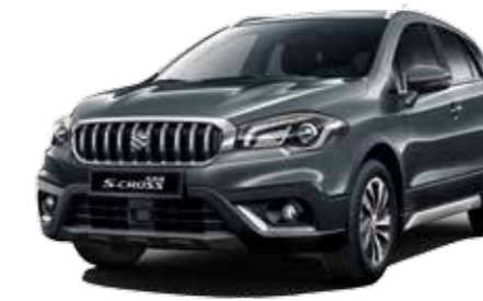
Mineral Grey Metallic