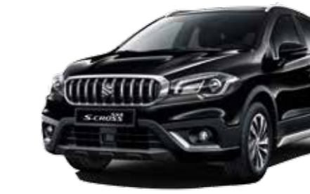
Cosmic Black Pearl Metallic