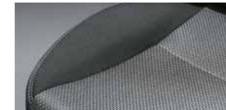
Fabric with silver stitching (SZ-T)