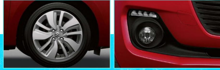
16" alloys available on SZ-T and Attitude models only.