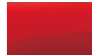
Fervent Red Available on all models