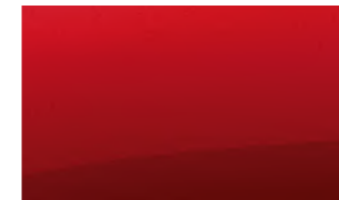
Burning Red Pearl Metallic Available on all models