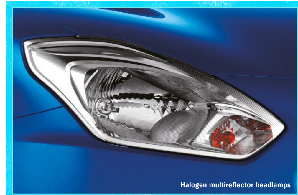
Halogen multireflector headlamps