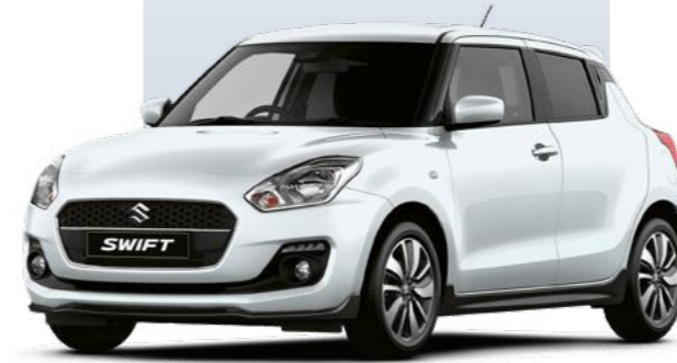
Pure White Pearl Available on all models