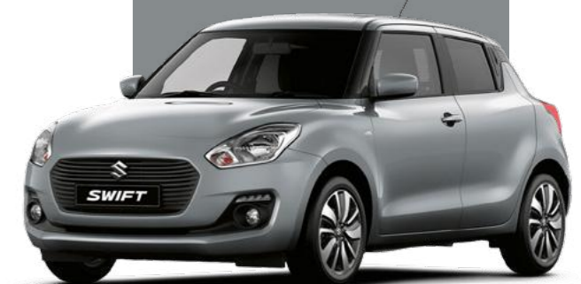
Premium Silver Metallic Available on all models