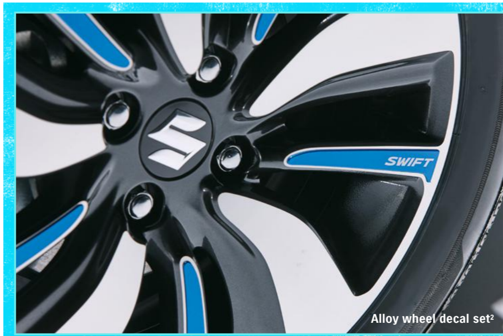
Alloy wheel decal set 2