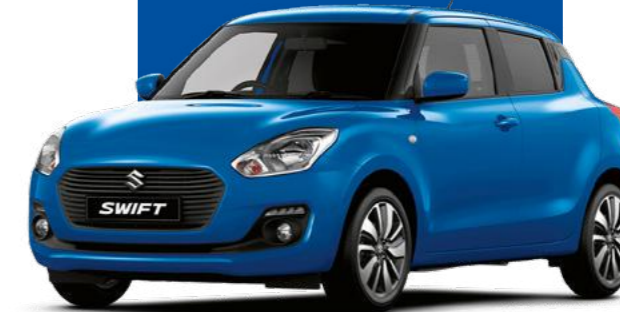
Speedy Blue Metallic Available on all models