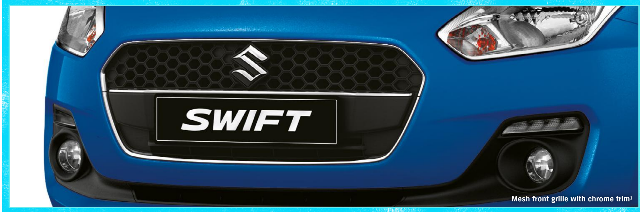
Mesh front grille with chrome trim 1