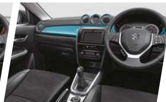
Turquoise instrument panel and vent surrounds

As standard on Atlantis Turquoise/Cosmic Black exterior colour option.