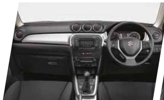
Silver instrument panel