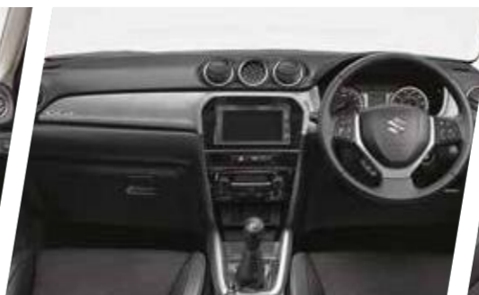
Chequered instrument panel