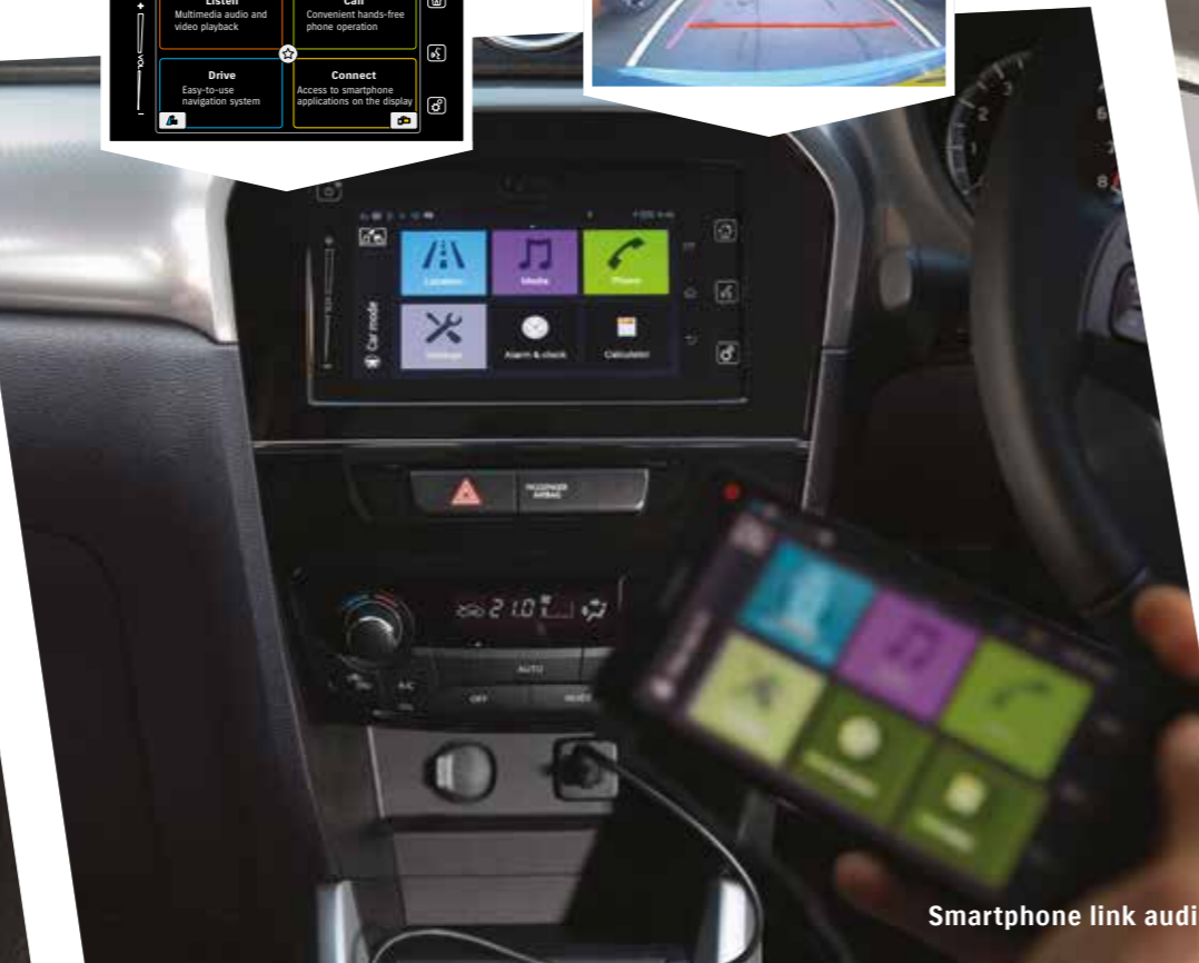
Smartphone link audio*