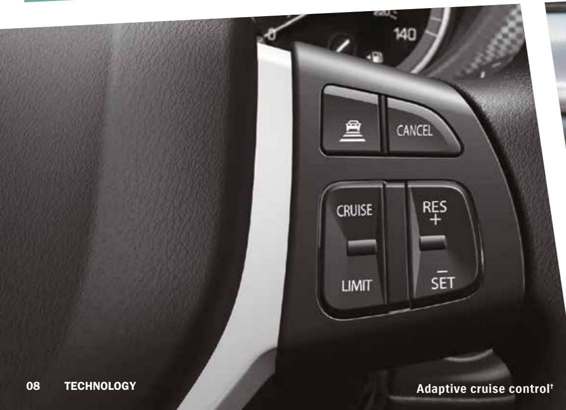
Adaptive cruise control†