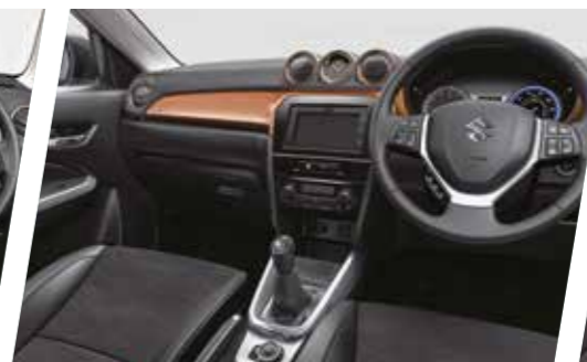
Orange instrument panel and vent surrounds

As standard on Horizon Orange/Cosmic Black exterior colour option.