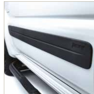
SIDE MOULDING SET