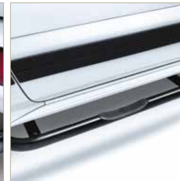
SIDE SPORT BAR SET (BLACK)