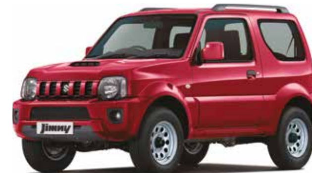
PHOENIX RED PEARL METALLIC*