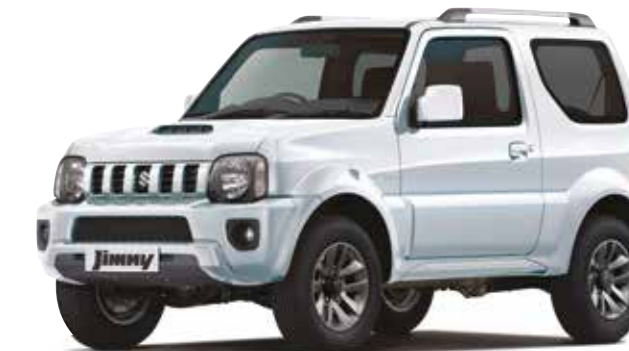
PEARL WHITE METALLIC†