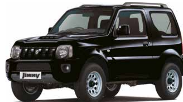
BLUEISH BLACK PEARL METALLIC*