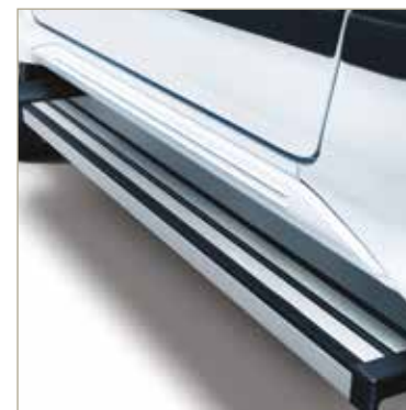
ALUMINIUM RUNNING BOARD

Whether you're down the high street or up a mountain, the Jimny has the versatility to cope. And its range of good-looking, hard-working accessories only makes it better. You'll find all of them on our website. So for once, we're going to suggest you let your fingers do the walking to: suzuki.co.uk/cars/accessories