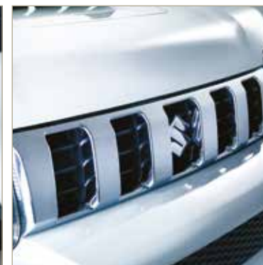
CHROMED FRONT GRILLE TRIM