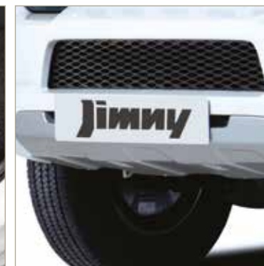
FRONT SKID PLATE