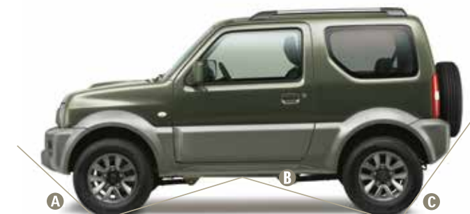
A 34° approach angle (default setting, unloaded Jimny) B 31° ramp breakover angle C 46° departure angle

All year round, the Jimny is a 4x4 designed for adventure. Every time you climb aboard, there's one waiting to happen.