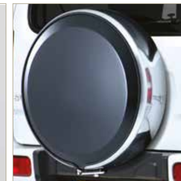
HARD SPARE WHEEL COVER