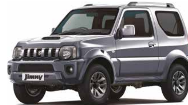
QUASAR GREY METALLIC*†