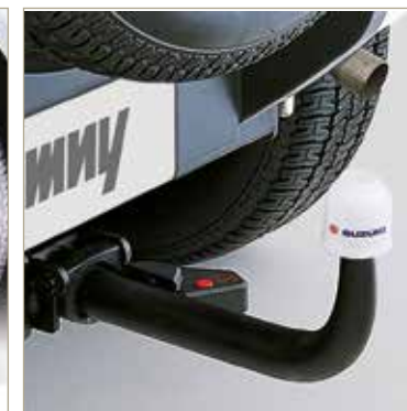
DETACHABLE TOW-BAR ASSEMBLY