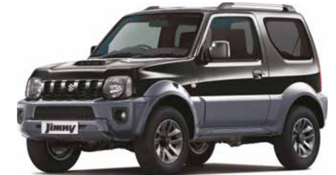
BLUEISH BLACK PEARL METALLIC/ QUASAR GREY 2-TONE†