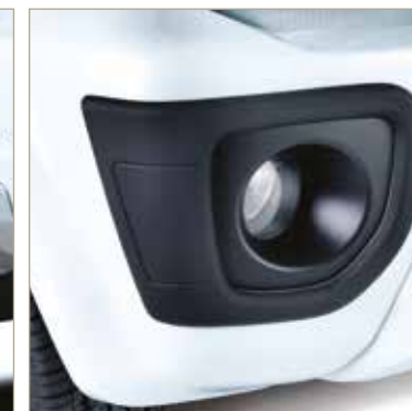
BUMPER CORNER PROTECTOR SET