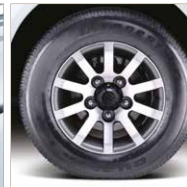
'DAKAR' ALLOY WHEEL