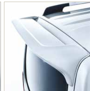
REAR UPPER SPOILER