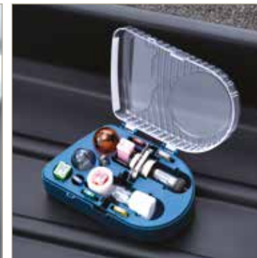
SPARE BULB AND FUSE SET