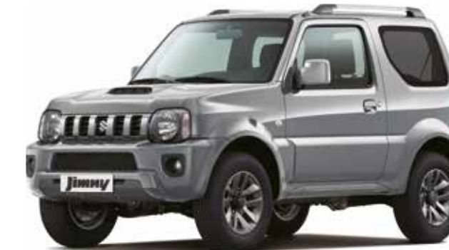
STEEL SILVER METALLIC†