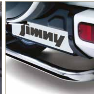
CHROMED REAR SPORT BAR