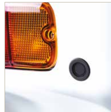
REVERSING AID SENSOR SET