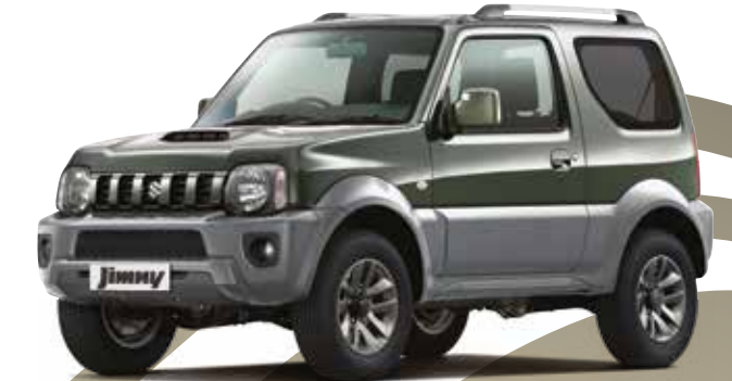
KHAKI GREEN METALLIC/ QUASAR GREY 2-TONE†